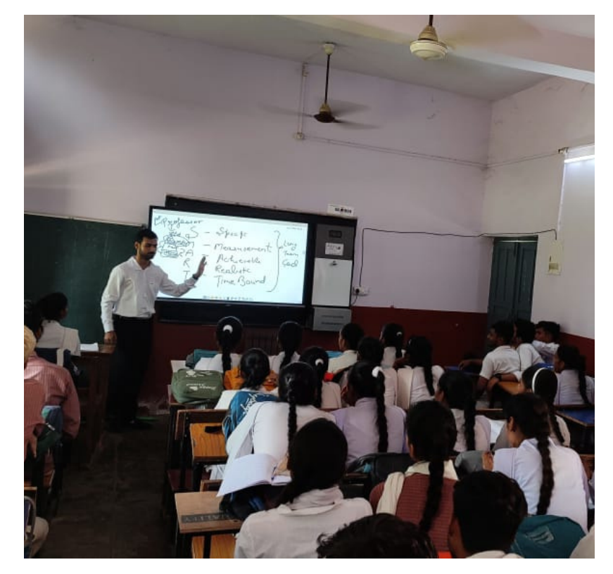
GD Perfect Tution Classes conducted a mentoring session for Government School students .